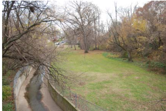
The Dueling Grounds