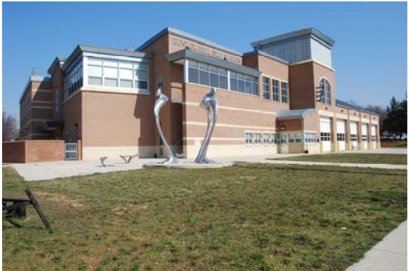
Bunker Hill Fire Station