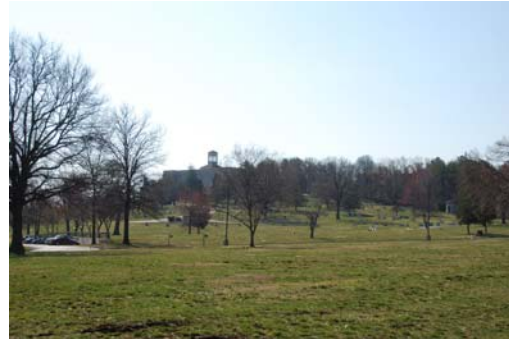
Ft. Lincoln Cemetery